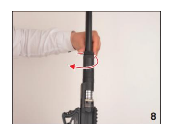
8. Unscrew the gas system retaining nut by turning in arrow direction