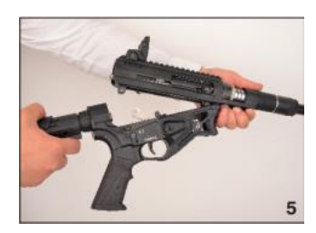
5. Separate Upper and Lower Receiver