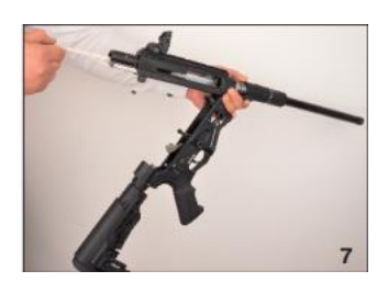
7. Takeout bolt and action bar