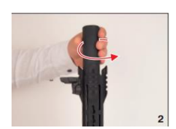
2. Take out the barrel shroud