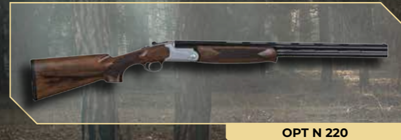
OPT N 220