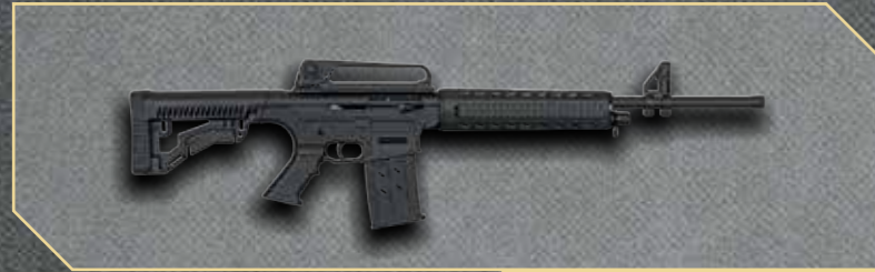
OPT VM G1 20