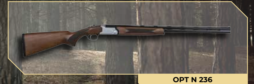
OPT N 236