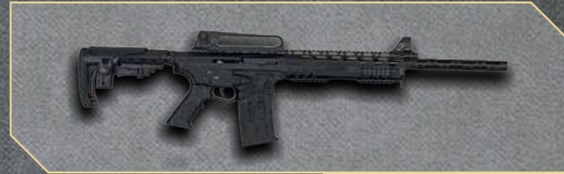
OPT VM G1 36