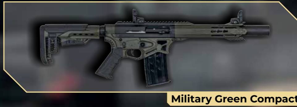
Military Green Compact