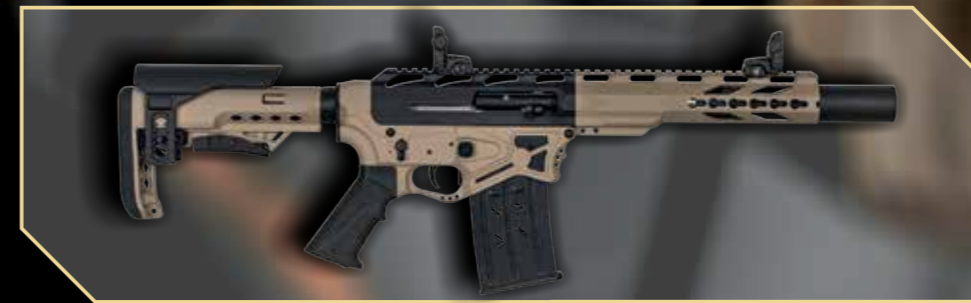
Desert Sand Compact