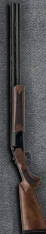
Over & Under